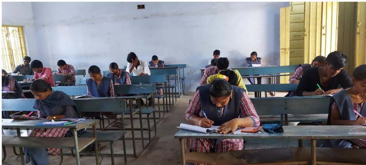
Remedial class slip test

Counselling on how to write the examinations without any fear and tension.