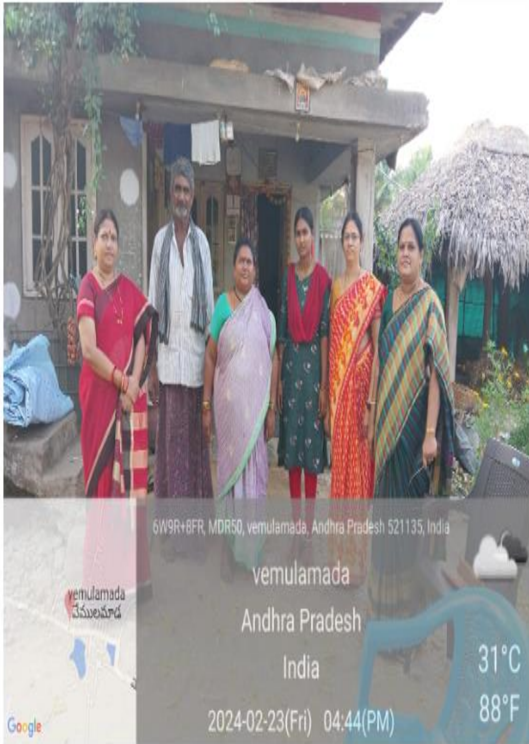
1 of 1 VISIT TO THE STUDENTS HOUSE