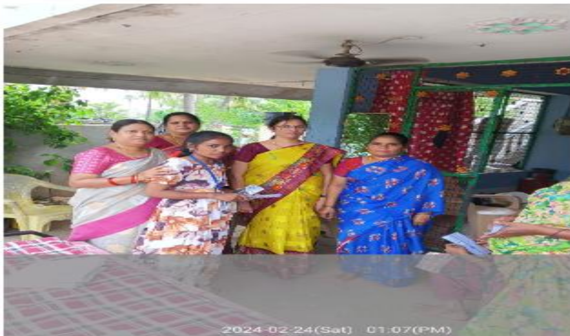
Met the parent of Puja IIBZC AT Penmatsa