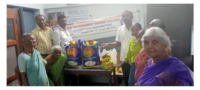
Our college staff members Visited the MAMATA Oldage Home in Gudivada and handing over the rice bags.

Overall, this initiative reflects a holistic approach to education, emphasizing not only academic excellence but also the importance of social responsibility and community service. It sets a positive example for other educational institutions and demonstrates the collective power of small acts of kindness.