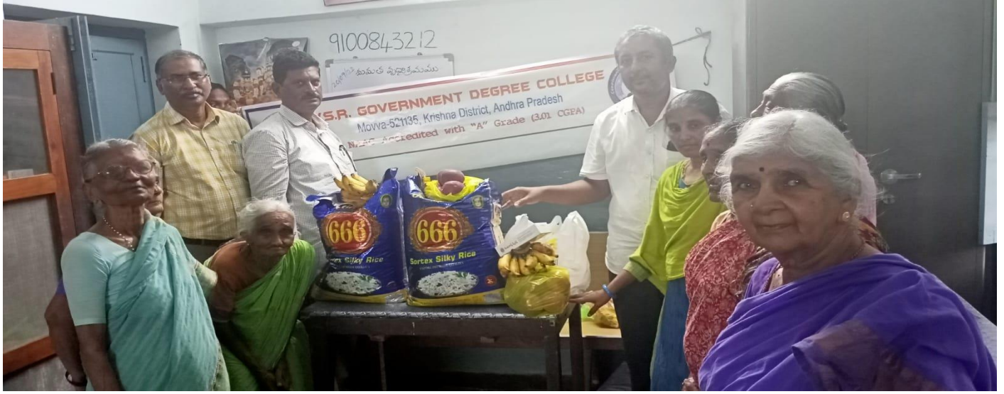
Our college staff members Visited the MAMATA Oldage Home in Gudivada and handing over the rice bags.