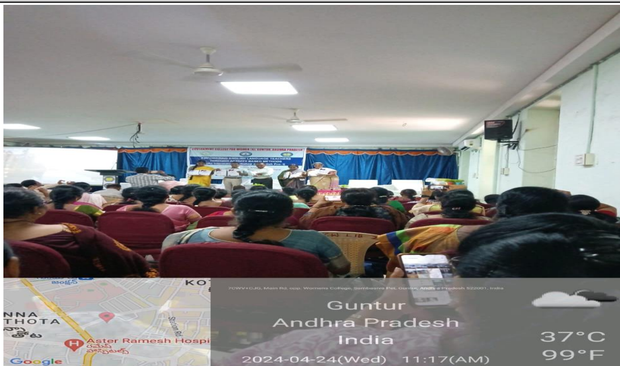
Empowering English Language Teachers Through Activity Based Methods ( An Interactive Workshop on English Pro-1) organised on 24 April 2024 at Government College for Women(A), Guntur.