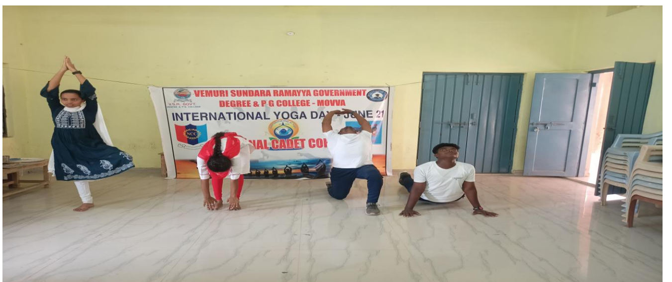
International Yoga Day, on 21 June 2024 at VSR GDC Movva